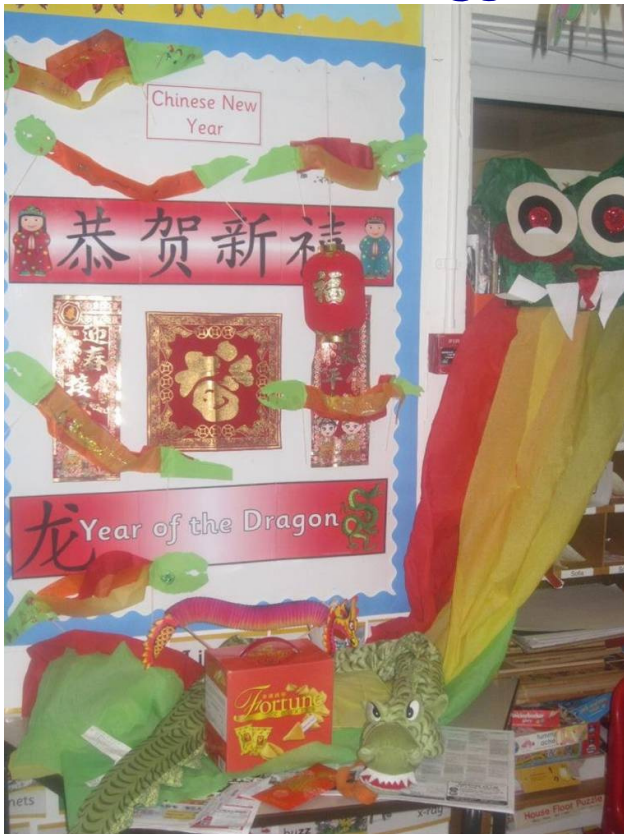
Reception children made a Chinese dragon.