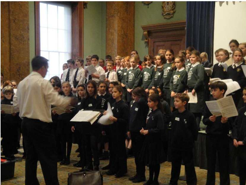
Year 5 at The Fishmongers' Hall last Friday

If you would like to donate a pack of soap, clean toothbrushes and toothpaste, the villagers will be delighted, for soap etc is a luxury for them! Thanks a lot!!!