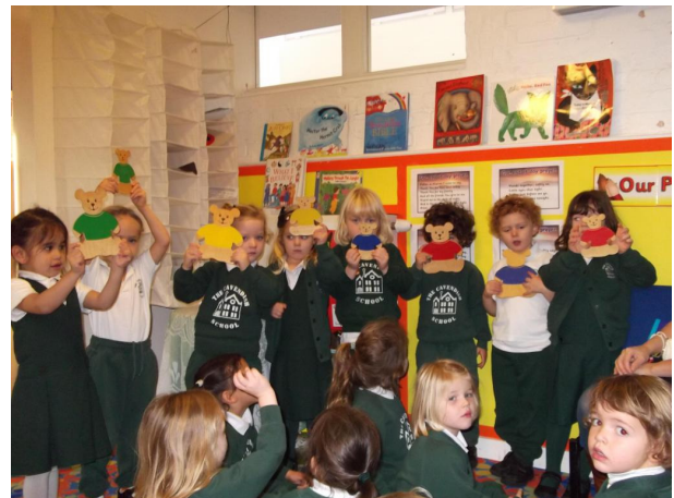
Nursery learning some colours in French