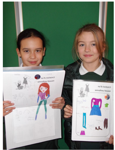
Y6 revised items of clothing and created a new uniform for The Cavendish School.