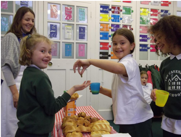
Y3 learnt to order some food at the boulangerie. "Je voudrais un croissant s'il vous plait. Merci madame."