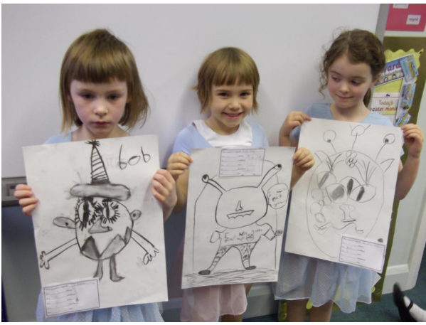
Y2 revised parts of the body and created monsters with charcoal.