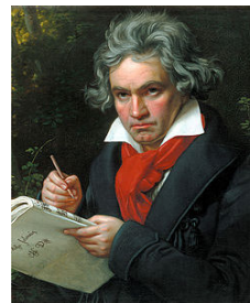
LUDWIG VAN BEETHOVEN