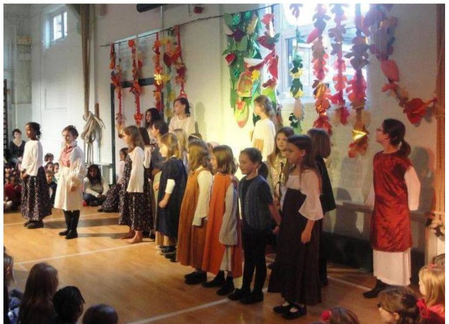
Babushka assembly by Year 4