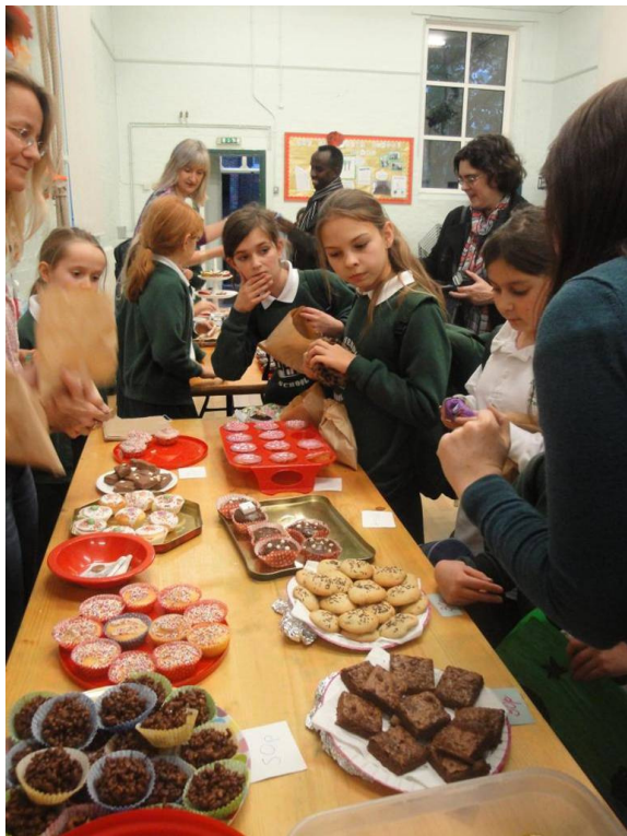
Year 5 cake sale on Friday 11th November