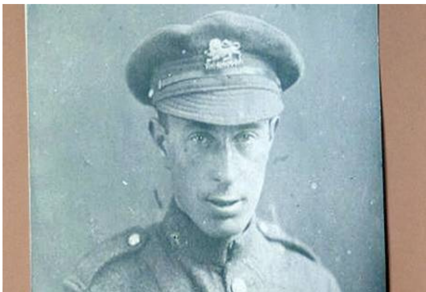
A photograph of Isaac Rosenberg, possibly dating from October 1917.

Included in the assembly was a poem by a young soldier from London’s East End.